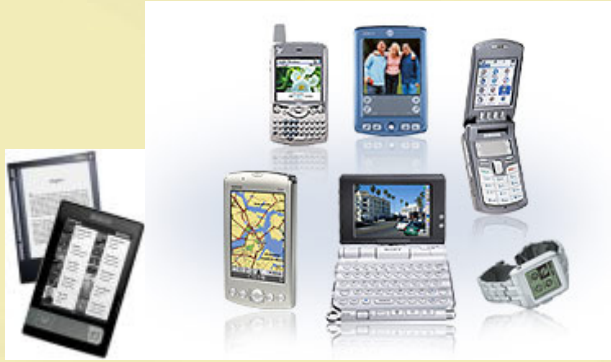
Dedicated devices (Cybook, iLiad, Pepper-Pad)